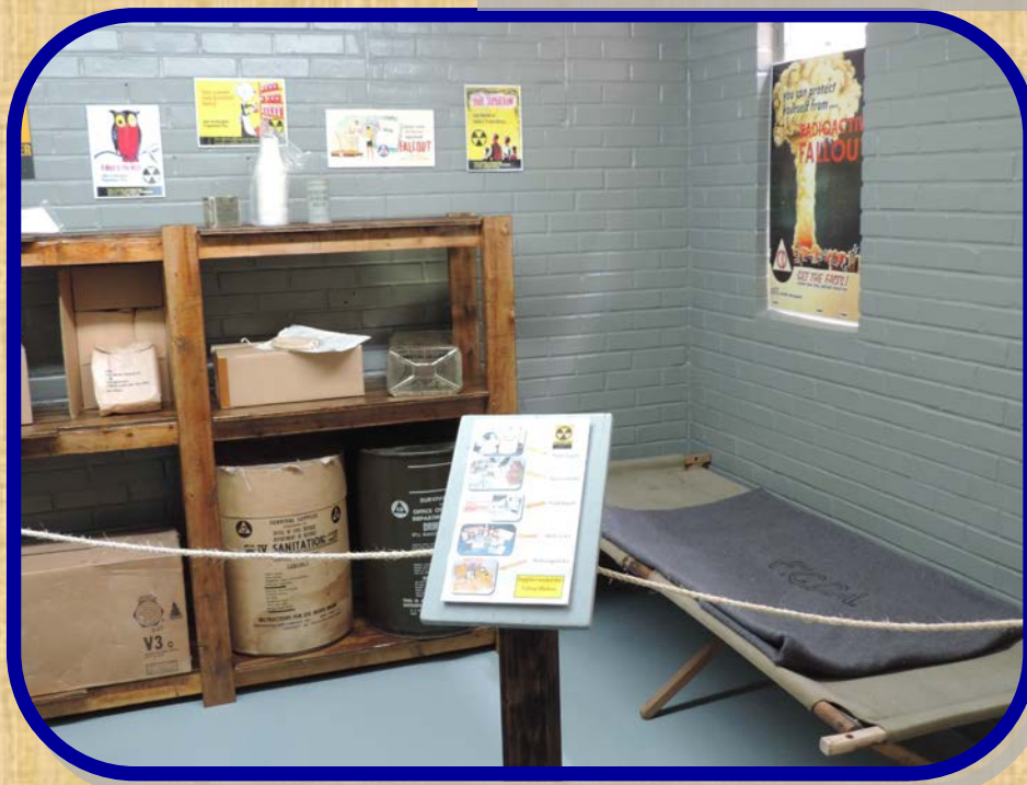
Fallout Shelter Exhibit at the SRS Museum